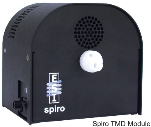
Spiro TMD Module